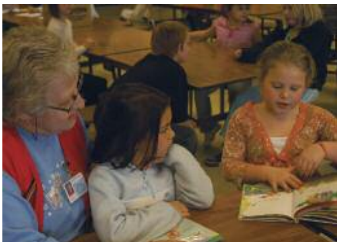
The foster grandparent program at the elementary schools helps create a caring environment.